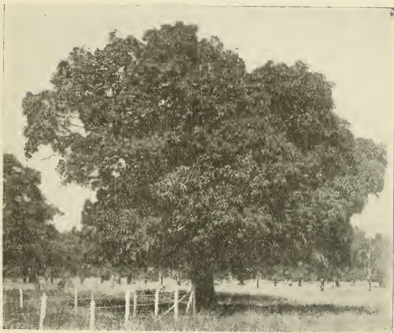
SEEDLING TREE OF THE MANGA RACE, NEAR SANTIAGO DE LAS VEGAS.